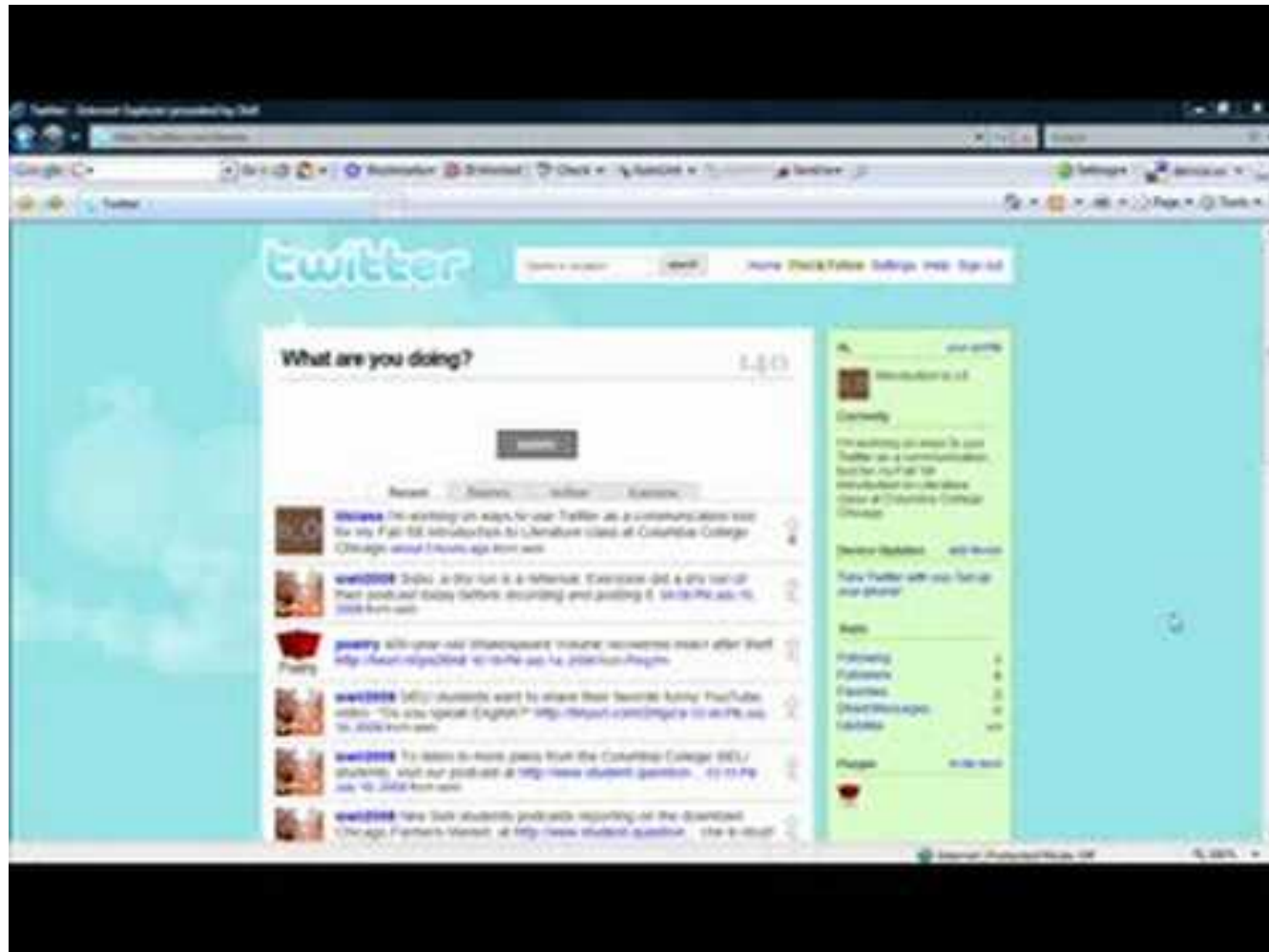
Chicago Speech (2008)